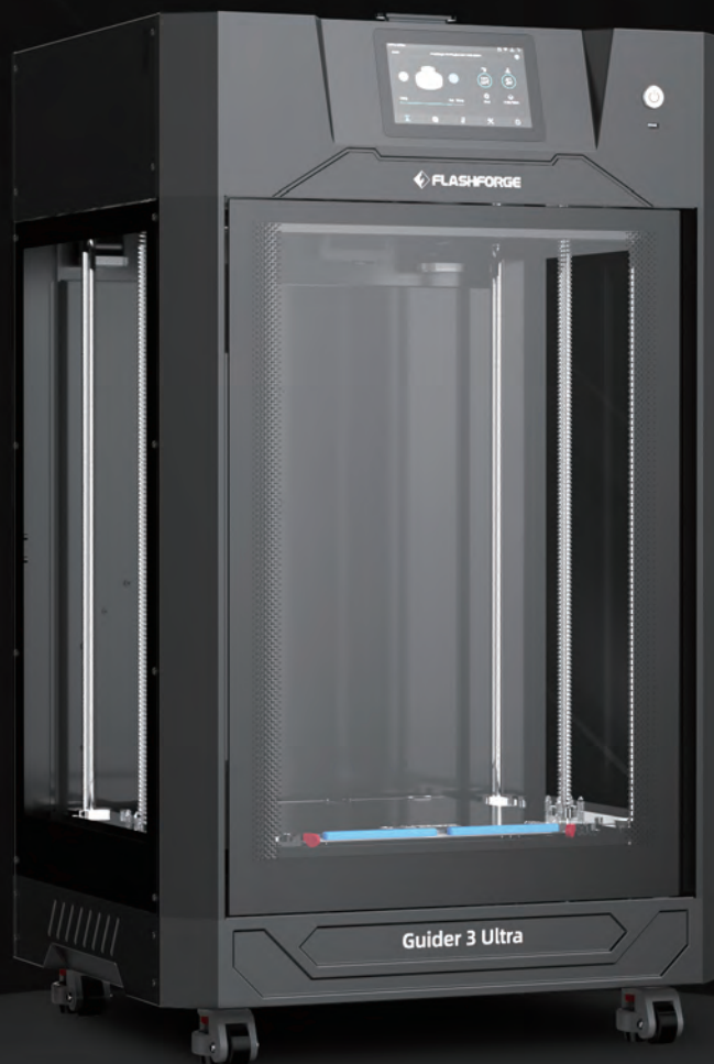
Guider 3 Ultra